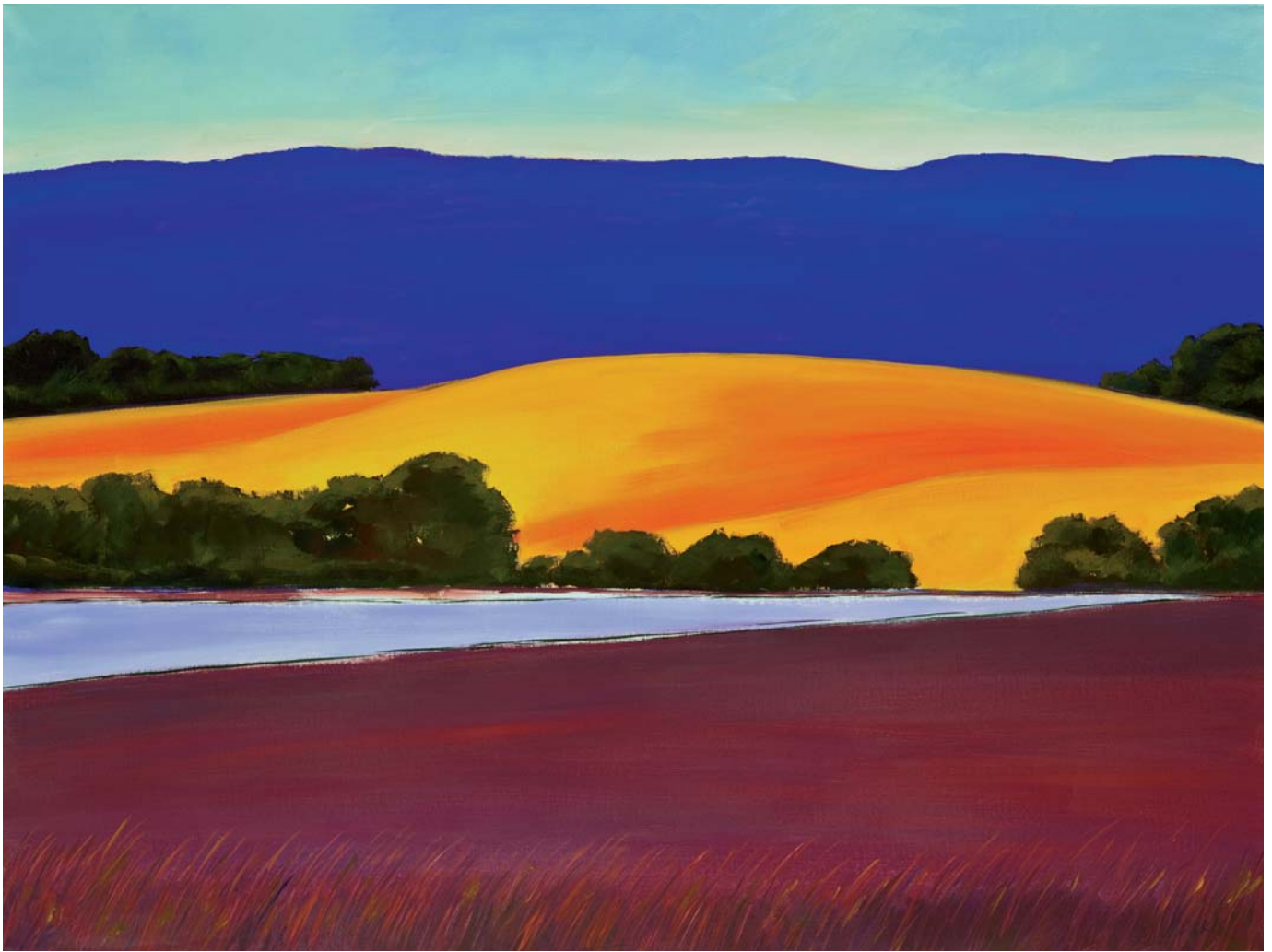
SAN GERONIMO, OIL ON CANVAS, 30 X 40"